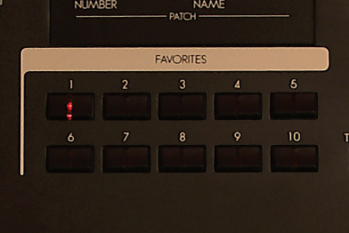
DISPLAY SHOWING P51