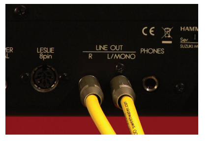
1/4" CABLES IN JACKS ON BACK OF SK

Using our 8 pin cable, the SK's onboard Digital Leslie is disabled, and the front panel Leslie switches will control the external Leslie. The Extravoices will not speak through the rotary Leslie elements, but through the keyboard amp attached.