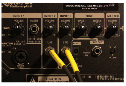
1/4 INCH CABLES PLUGGED INTO 2121 REAR