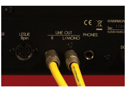
1/4 INCH CABLES IN JACKS ON BACK

We recommend running the SK in stereo when you can, although it will sound great in Mono as well.