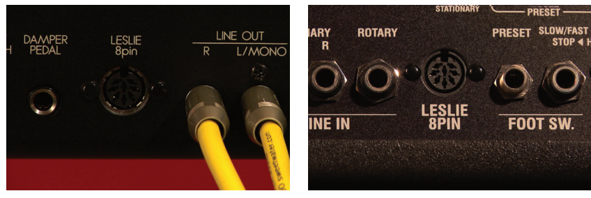
8 PIN LESLIE JACK

If you're using a Leslie 3300, find the 8 pin jack on the back panel of your 3300 and attach the cable there.