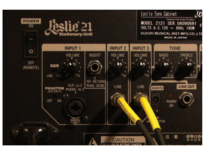
1/4" CABLES PLUGGED IN 2121 REAR