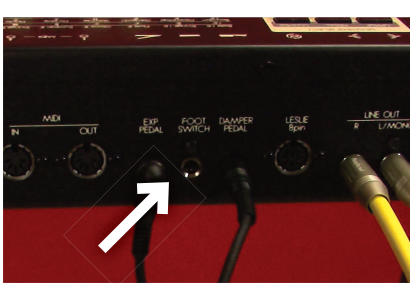
LESLIE FOOT SWITCH