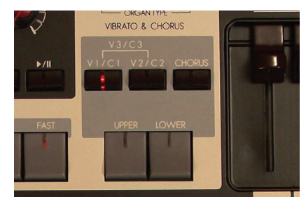
VIBRATO & CHORUS BUTTONS

The Vibrato & Chorus is an important part of the Hammond Sound. While the SK doesn't have the iconic round knob of the vintage B-3, the controls do the same thing, and have the same effect on the sound. Select which Keyboard you wish to have the Vibrato & Chorus: Upper, Lower or Both. The three classic degrees are chosen via two buttons. Press V1/C1 for "1," V2/C2 for "2" and by pressing both of those buttons together, you get "3." Select the Chorus button to switch the generator to Chorus mode. These settings are remembered in each preset, and like most of the controls on the front panel, you can edit them "on the fly" while playing.